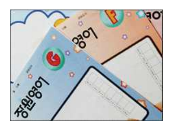
[Target Age] Preschooler to middle school student