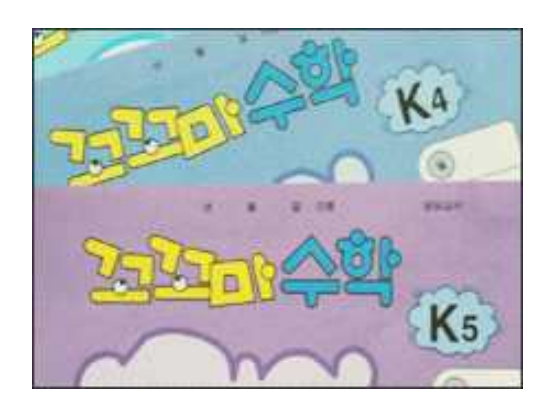
【Target Age】 1 year-old-child, Kindergartener, Elementary 1st grade