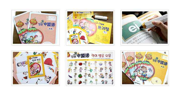
[Target Age] Elhi student