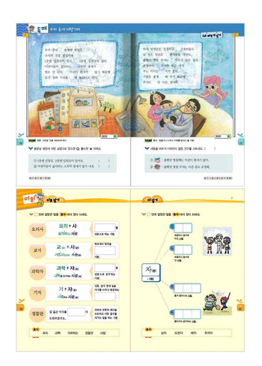
[Target Age] Preschooler to middle school student

[Level] 1 \sim 4 (14 \text{ courses in total} : A \sim N)