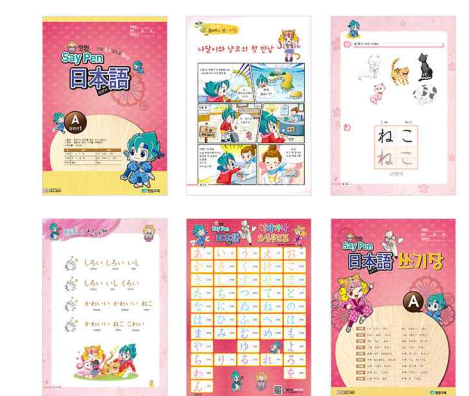
[Target Age] Elementary 3rd grade

[Level] 1 \sim 4 (10 courses in total: A to J)